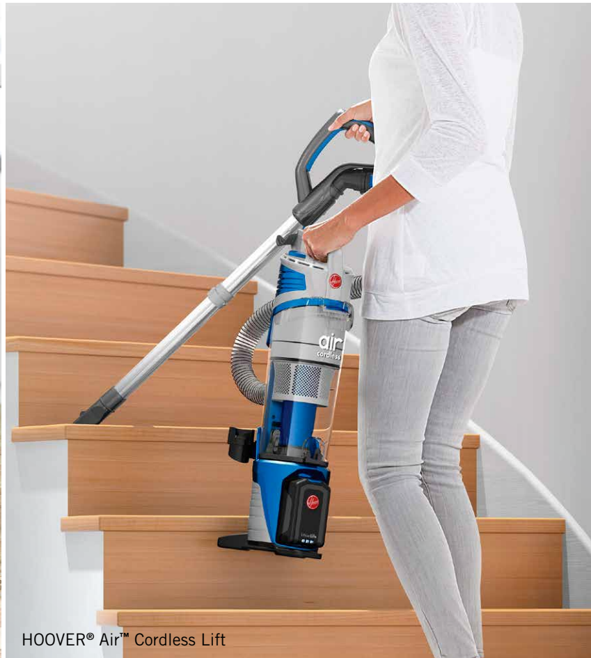
HOOVER® Air™ Cordless Lift