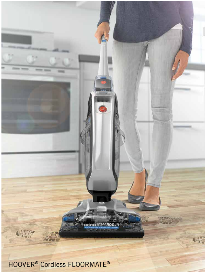
HOOVER® Cordless FLOORMATE®

In North America, our HOOVER cordless lithium range of stick and upright vacuums are gaining popularity. Standout products are the HOOVER LINX cordless stick that received industry recognition as the best cordless vacuum in a review by a respected consumer product testing group and the innovative HOOVER AIRLIFT deluxe cordless upright with a one-hand lift off canister. Dirt Devil launched a new range of Power series vacuums and hand held stick vacuums for the